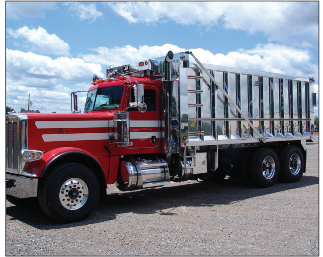
Polished aluminum is a popular option.