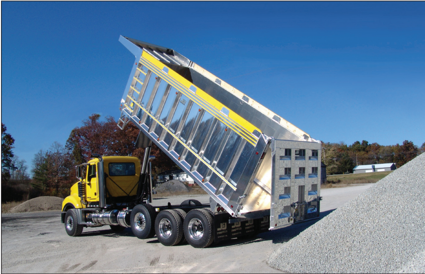
J&J Material Hauler dump bodies are designed to maximize payload.