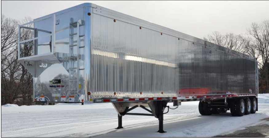
The top rail, side panels and bottom rail have yield strengths of 40,000 lbs. and Brinell hardness of 95, creating a superior sidewall system designed for years of dependable service.