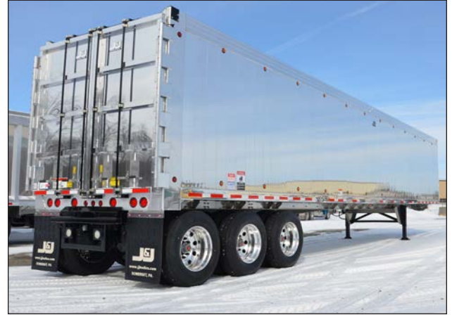
The air operated, stainless steel, 3 latch gate control combined with a v-block and slop latch provide a secure, sealed, and easy to operate tailgate system.