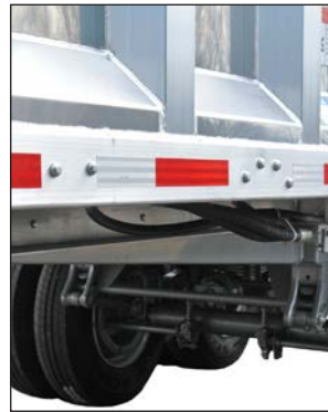
Every third crossmember huck bolted to bottom rail for superior sidewall to crossmember connection. Aluminum z-rail huck bolted to steel subframe and moving floor drive system to prevent trailer flexing during unloading cycle.

Access Steps: Cast aluminum steps, driver side (inside trailer) mounted on front corner.