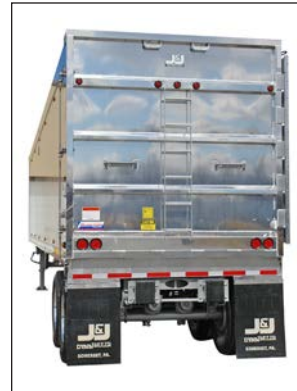
Standard tailgate includes a 3/4 ladder to prevent tarp flap damage, while mid-steps and grab handles provide a stable position to dress tarps. The continuous full length hinge is fully greasable and alleviates tailgate sag.

*Standard specifications may vary according to customer's preferences and requirements. Many options available.